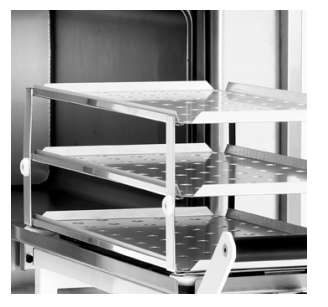
Set of shelves used to load containers (STU) and individual packs directly on the shelves.

* For optimized ergonomics, use together with the loading trolley.