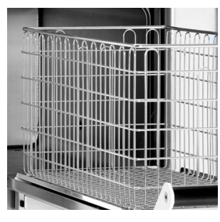
The perforated tray with rollers supports loading of modular wire baskets. For one wire basket (590 x 300 x 190 mm) or 2–3 baskets (590 x 300 x 100 mm), or a combination.