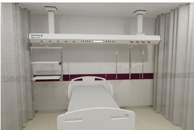
Rack & pole solution.

The Somnus light has been developed according to the Lighting Research Center Recommendations. Bluish tones simulate morning light, while reddish ones represent evening light (based on the Circadian Stimulus).