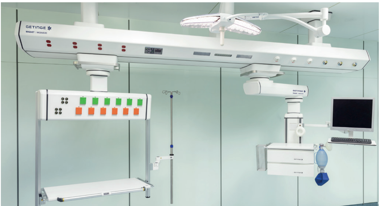
Premium solution with Sky Module.

Getinge has developed a horizontal solution to accommodate architectural constraints: Moduevo Bridge. This economical, space-saving ceiling supply unit is designed to enhance provider-patient interactions at all acuity levels by keeping everything close at hand. It can be installed in intensive care and high-dependency care units, recovery and emergency departments.