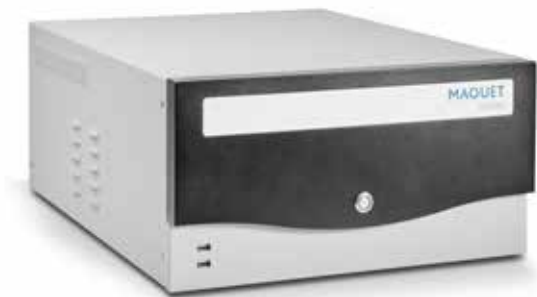
Small but powerful: Tegrís comes in a compact box, which can be placed inside or outside the operating room.