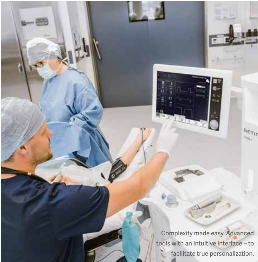
Complexity made easy. Advanced tools with an intuitive interface – to facilitate true personalization.