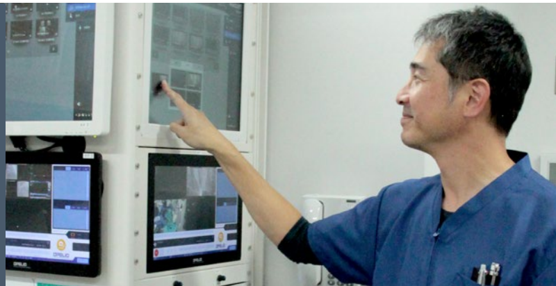
Ichinomiya Municipal Hospital uses Getinge’s Tegrís OR integration system to connect 15 rooms, including 12 operating rooms, two cath labs and a hybrid operating room.