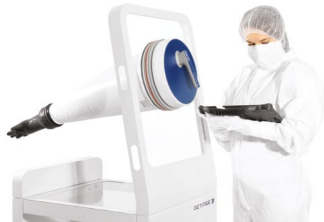
Glove Leak Tester (GLT) shown on demo display

Ensure a safe production and process control with the paperless Glove Leak Tester that enables seamless in-situ glove testing. Wireless, paperless and pipeless, the GLT allows for accurate and repeatable testing for glove and sleeve integrity, i.e. detecting perforations not visible to the naked eye.