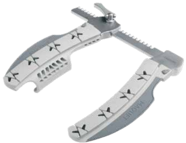
Activator II Drive Mechanism